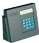
PAXOS class D